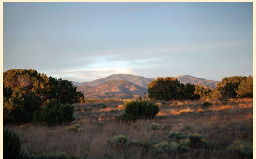
A herd of antelope frequent this property. Views abound of the Jemez, Sangre De Cristo, Ortiz and Sandia mountain ranges, and the Galisteo Basin.